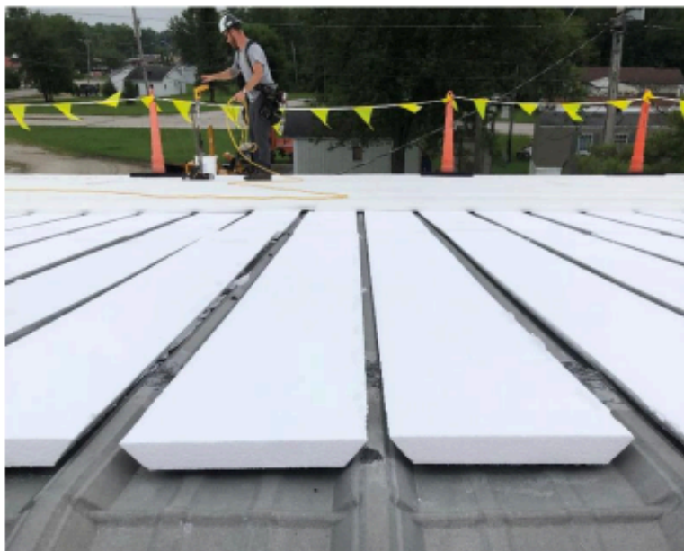
Cellofoam Flute Fill in the foreground. In the background, a roofer is installing Cellofoam FR Composite Sheet over the flute fill.

Cellofoam® EPS Flute Fill serves as a void fill installed within the flute of an existing metal roof as a component of a retrofit system. The product is either loosely laid or mechanically attached to provide a uniform and level substrate. Cellofoam EPS Flute Fill is custom cut with either a square or tapered edge to accurately fit nearly any metal deck or steel roof profile. The core of the Flute Fill is a premium, rigid, modified expanded polystyrene (EPS) insulation with closed cells molded in a range of densities to provide a variety of compressive strengths to meet project specifications and requirements. EPS provides a long-term, stable R-value, superior compressive strength, moisture resistance, and energy and cost efficiency. It is 100% recyclable, and is often used as a replacement for Polyiso with up to 40% cost savings. Cellofoam EPS Flute Fill is a premium product, and is produced to meet or exceed ASTM C578, Standard Specification for Rigid, Cellular Polystyrene Thermal Insulation .